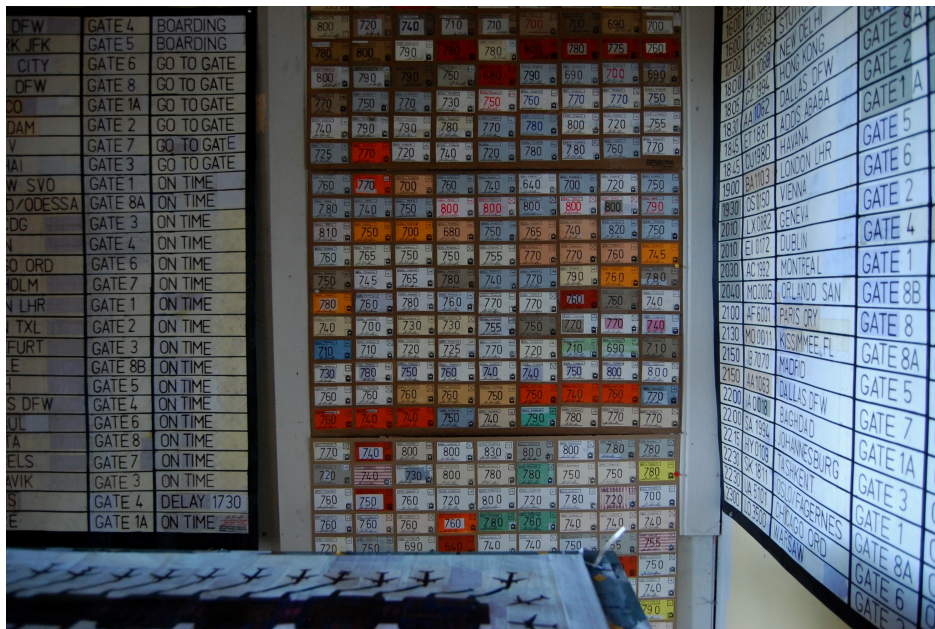
GARY FARRELLY: Terminal Compositions at Dallas' Ro2 Art, Nov. 9 – Dec. 12, 2012

GARY FARRELLY: Terminal Compositions opens November 9, 2012 (DALLAS, TX) Ro2 Art DOWNTOWN PROJECTS | 110 N. Akard St., Dallas, Texas | 214.803.9575 | Ro2Art.com