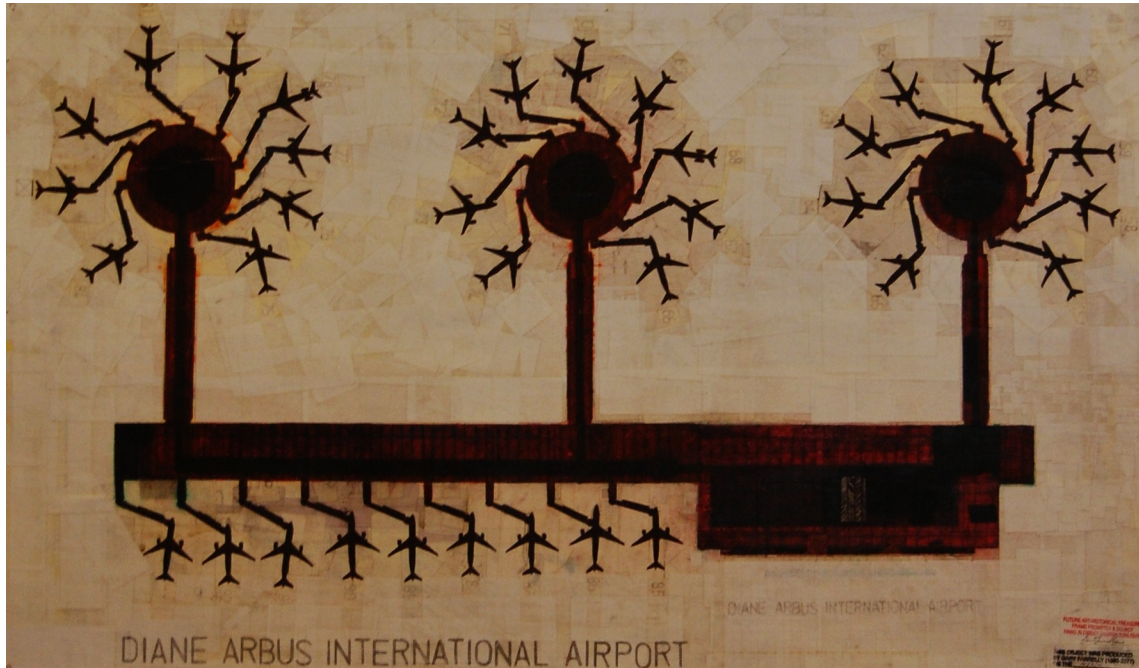
Gary Farrelly, Diane Arbus International Airport , 2012, mixed media water color on paper