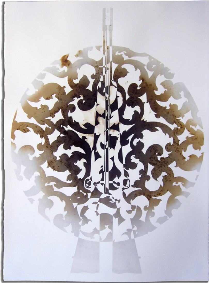
Ryder Richards, "Disruption II" 2011 Gunpowder, graphite on paper, 30"x22"